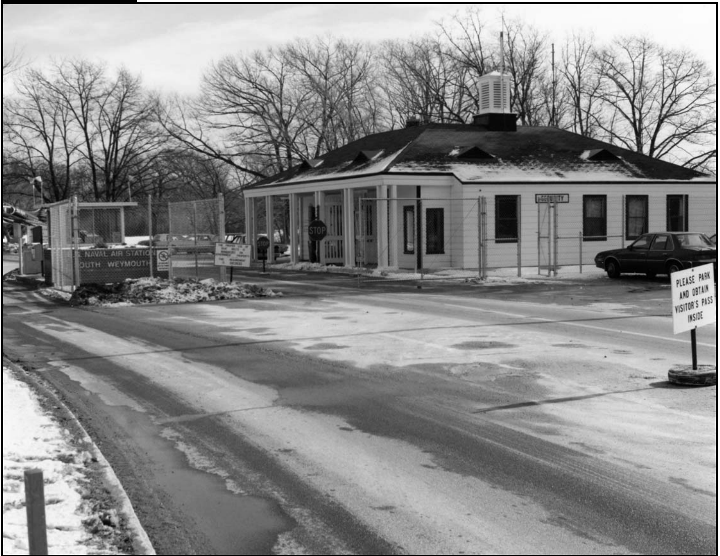
Remember being stuck in that long line of traffic crawling towards the White Street gate at NAS South Weymouth on drill weekend Saturdays and Sundays?